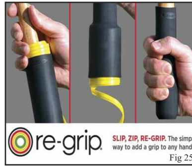
re-grip. SLIP, ZIP, RE-GRIP. The simple way to add a grip to any handle! Fig 25

aisle, the demo on the next item caught my eye. It is a rubber sleeve