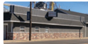
Complete Color Auto Collision is proud to say it's the only body shop in its area spraying a waterborne product.

Type: Collision Repair Facility Facility Employees: Five In Business Since: 1999 Number of Locations: One Production Space: 8,000 square feet