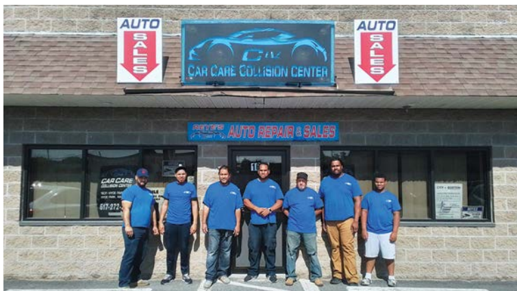
To ensure a safe environment at CIV Car Care Center, the team purchased CPS Products' MAXXAIR™ MX3030 Refrigerant Management System.