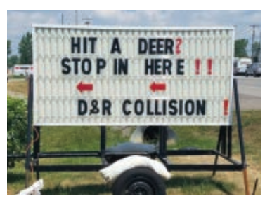
About 80 percent of D&R Collision's business comes from potential customers noticing the sign out front.

Company At A Glance... Type: Collision Repair Facility Employees: Two In Business Since: 2014 Number of Locations: One Combined Production Space: 2,000 square feet