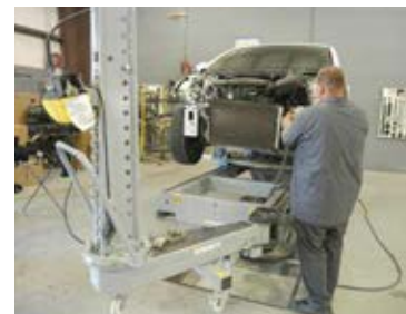
Steve Roller at Mike's Auto Body is setting up to pull a frame on a Spanesi 106 Universal Fixture Bench.