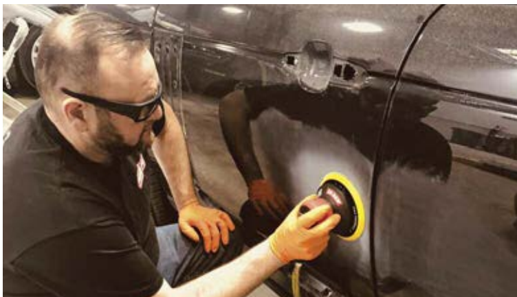
Florida Pneumatic's AIRCAT 6700-6-336 6-inch Orbital Palm Sander has a lubrication-free air motor.

"There is a right way and a wrong way of fixing these vehicles," he said. "The more complex these cars are becoming, [the more] we have to invest in more equipment and more tools, and we've found that it's [about] quality, not quantity."